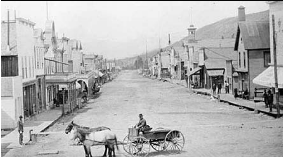
Main Street, Breckenridge, Colorado, about 1889.