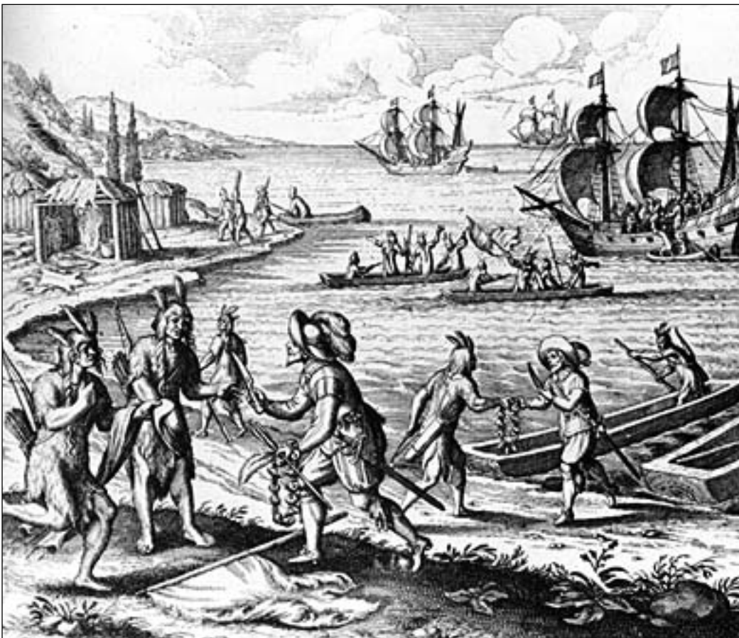
Theodor deBry, 1634.