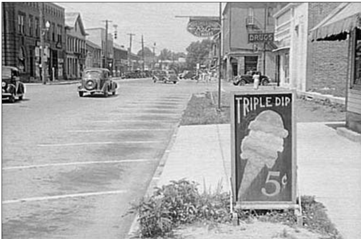
Main Street, Plain City, Ohio, 1938.