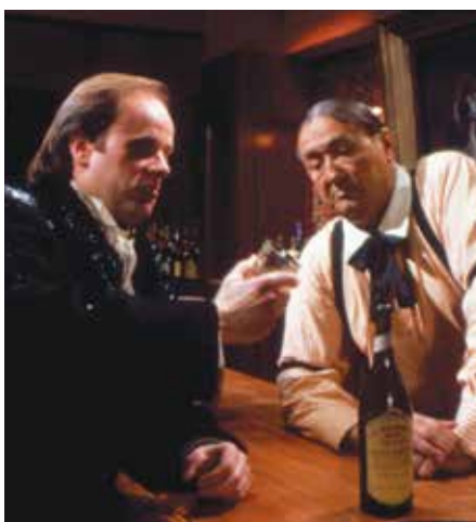
Scene from Stephen Crane's short story, "The Blue Hotel."

A dramatization of Frank O'Connor's "First Confession" and an interview with Ernest Gaines demonstrate the elements of fiction.