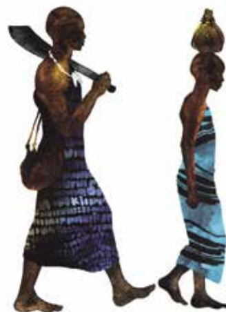
Illustration by Kareem Iliya

In this modern African novel, Chinua Achebe's story follows the lives of people trying to understand which belief systems deserve their loyalty. The protagonist Okonkwo is a tribal leader who battles neighboring villages, the influence of the English, and his own demons in early colonial Nigeria. The perspectives of readers from around the world reveal the novel's universal themes.