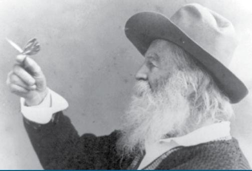
Walt Whitman, half-length portrait, seated, facing left, wearing hat and sweater, holding butterfly.

Brilliant readings of Whitman's poems demonstrate his American vision and style and vividly convey their poignance and sheer power. Whitman's sources, including Emerson, the King James Bible, opera, and political oratory, are revealed.