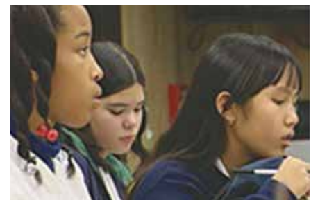
Seventh-grade students pose questions and topics for discussion.