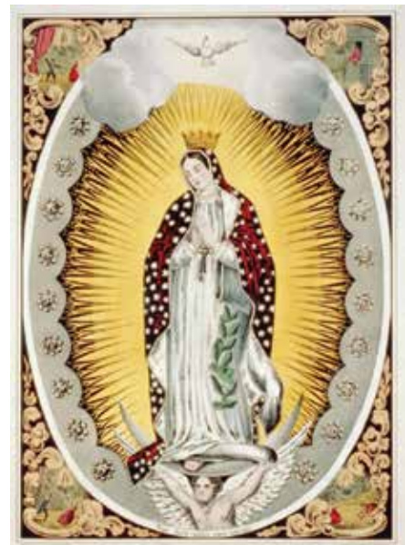
Currier and Ives, NUESTRA SEÑORA DE GUADALUPE: OUR LADY OF GUADALUPE (1848) courtesy of Library of Congress [LC-USZC2-2890].

The study of cultural geography focuses on how we shape our surrounding space and how natural and man-made landscapes affect our perspectives. This session looks at literary texts through the lens of relationships of people to their environments.