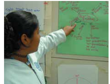
A student presents her connections to Alma Flor Ada's book, My Name Is Maria Isabel .

Students in Dorchester, MA, explore The Watsons Go to Birmingham—1963 by Christopher Paul Curtis. Their teacher uses nonfiction, documentary film, and historical photographs to contextualize the events in the novel and the Civil Rights movement. Curtis addresses students' questions and leads them in a writing workshop.