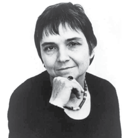
Anonymous, [ADRIENNE RICH] (ca. 1975)